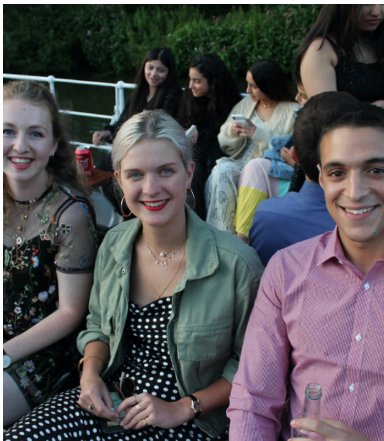
Some of the summer team at the Oxford Scholastica Ball on the River Thames

This is an outline job description and should not be regarded as an inflexible specification. Responsibilities will be reviewed periodically in line with service priorities and duties may change or new duties be introduced after consultation with the post holder. As a term of your employment you may be required to undertake such other duties and/or hours of work as may reasonably be required, including evenings and weekends during the summer school.