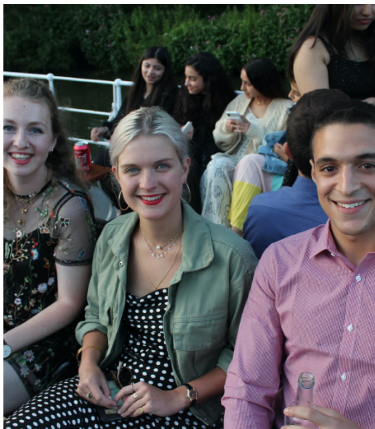
Some of the summer team at the Oxford Scholastica Ball on the River Thames

This is an outline job description and should not be regarded as an inflexible specification. Responsibilities will be reviewed periodically in line with service priorities and duties may change or new duties be introduced after consultation with the post holder. As a term of your employment you may be required to undertake such other duties and/or hours of work as may reasonably be required, including evenings and weekends during the summer school.