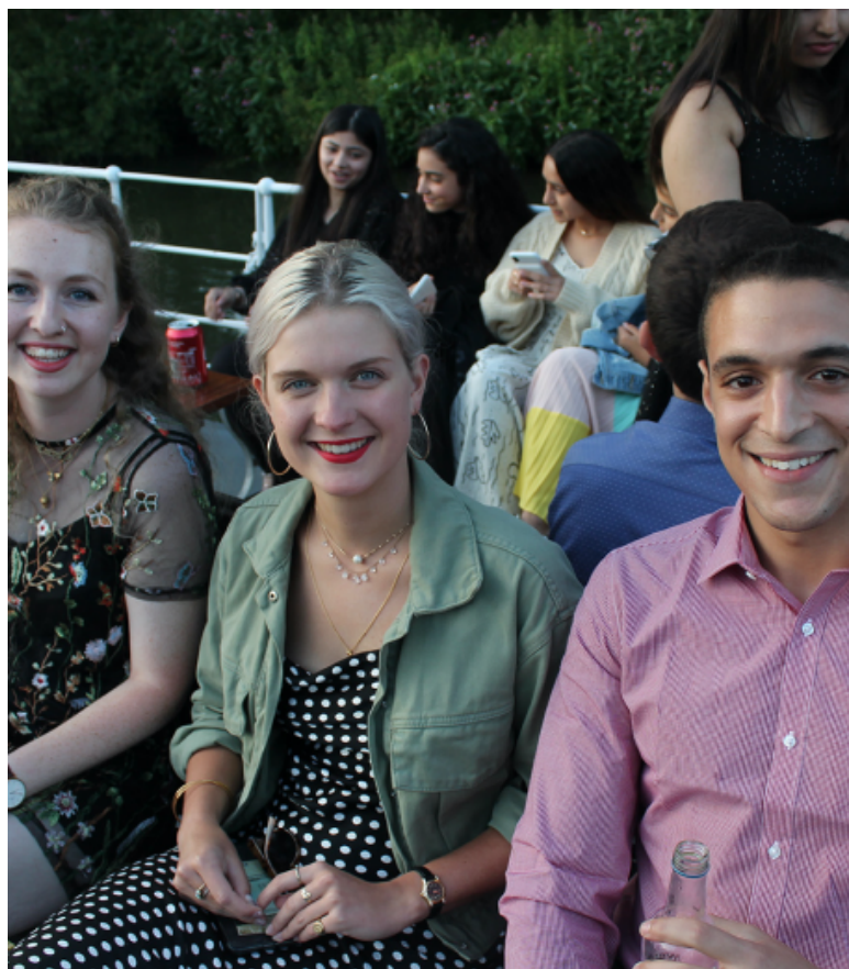
Some of the summer team at the Oxford Scholastica Ball on the River Thames

This is an outline job description and should not be regarded as an inflexible specification. Responsibilities will be reviewed periodically in line with service priorities and duties may change or new duties be introduced after consultation with the post holder. As a term of your employment you may be required to undertake such other duties and/or hours of work as may reasonably be required, including evenings and weekends during the summer school.