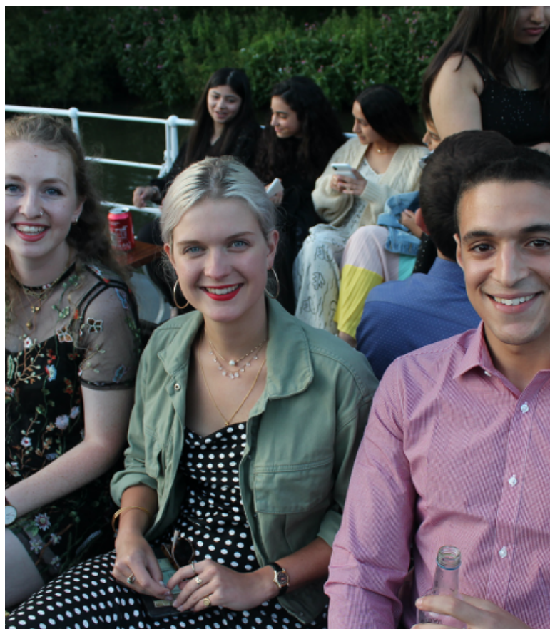
Some of the summer team at the Oxford Scholastica Ball on the River Thames

This is an outline job description and should not be regarded as an inflexible specification. Responsibilities will be reviewed periodically in line with service priorities and duties may change or new duties be introduced after consultation with the post holder. As a term of your employment you may be required to undertake such other duties and/or hours of work as may reasonably be required, including evenings and weekends during the summer school.